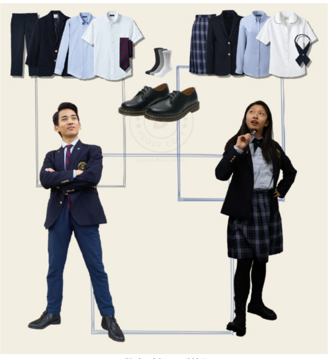
(Updated January 2024)