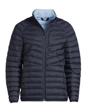
(must be navy blue, black or gray color)